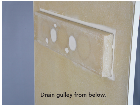
Linear shower base showing four gradients and three outlet locations in drain gully.